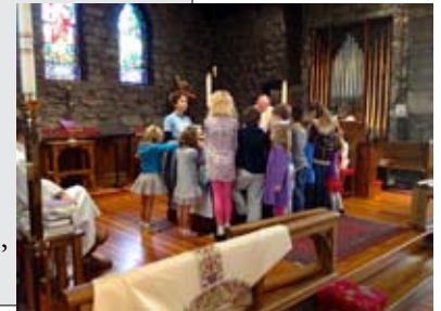
Our children participate in blessing the shawls