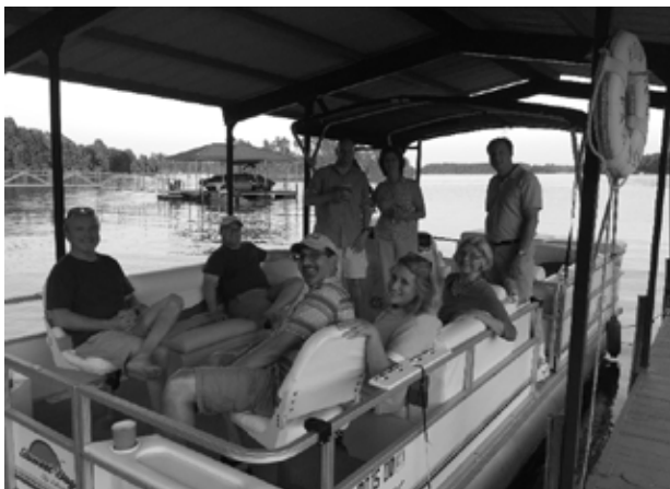
A lot of hard work with a little time left over for fellowship and relaxation.