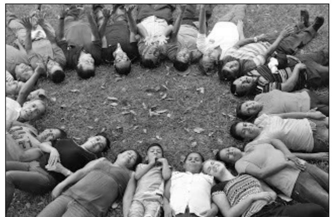
The group from the workshop in Santa Clara.

These are some really big problems that the communities are facing right now. The purpose of these workshops is really to introduce communities to each other and show them that they are not alone. It is a chance for them to come together, learn, and get support. The workshops also give them a space to celebrate their different cultures. We had a danza that was performed by the Comarca Ngobe Bugle, a play performed by the territories of Madugandi and Coclé, and folk stories told by different Campesino groups. I felt so in my element at these workshops. They talked about topics that I feel passionately about and really made me feel like I was where I was needed to be. Throughout any agricultural or community project that I might lead in these communities, it will be important to keep in mind the underlying political issues that are at play and that are affecting these groups.