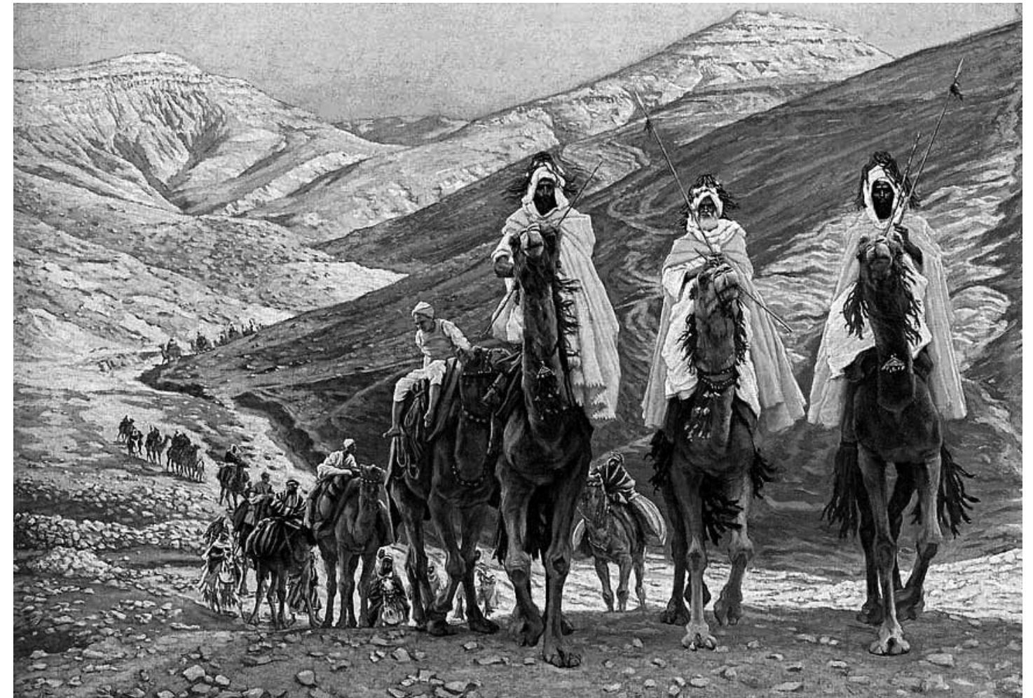
“Journey of the Magi” by French painter Tissot (1836-1902)

Between the two Sundays that mark the Lord's baptism and transfiguration the church concentrates on several of the other incidents from Scripture that show how Jesus manifested God's love to the world through His ministry of preaching, miracles, and healings. What is common to each of those epiphanies is that in one way or another they make known the identity and mission of Jesus Christ: True Man and True God born into this sinful world to be the Lord and Savior of all humanity.