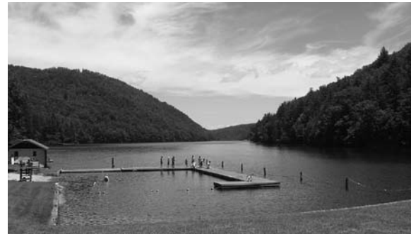
All proceeds benefit Lake Logan.